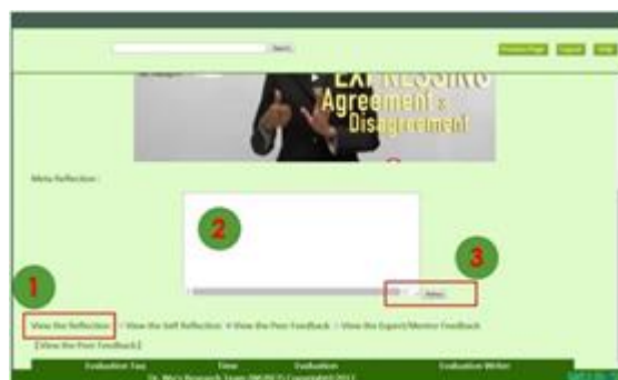
Figure 5. Meta-reflection feature

In meta reflection, novice teacher can see self-reflection comments, peer feedback and mentor feedback and they reflect on themselves based on multilevel reflection.