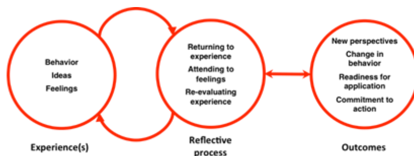
Figure 1. Reflection Cycle by David Boud (1985)

Labaree (2008) stated, "Teaching exited long before teacher education." (p.290). By observing the role of teachers in the field of education, their role is certainly very strategic in improving the quality of a school in accordance with national education. Femin-nemser (2001) stated that "The quality of schools of a country depends on the quality of teachers". This an evidence that the role of the teacher increasingly important to notice and the improvement the instructional practice of teachers on a periodically supposed be done both personally and institutionally. Hence, with the concerns, Zeichner & Liston (1987) as cited in Korkko, Kyro-Ammala, & Truman (2016) Reflection can be seen as a central component of a student teacher's professional development (p. 198).