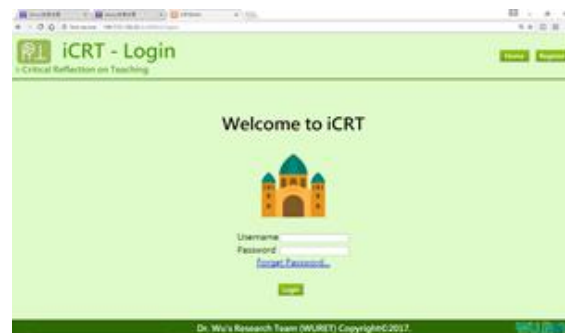
Figure 2. Login page

As a novice teacher, they got a lot more features than mentor and they need to upload their own teaching practice video with options (e.g., sharing option, type of education, video title, ID of embedded video and so on), especially for ID of embedded video, systems provide the way how to embedded the video from YouTube as the storage to system.