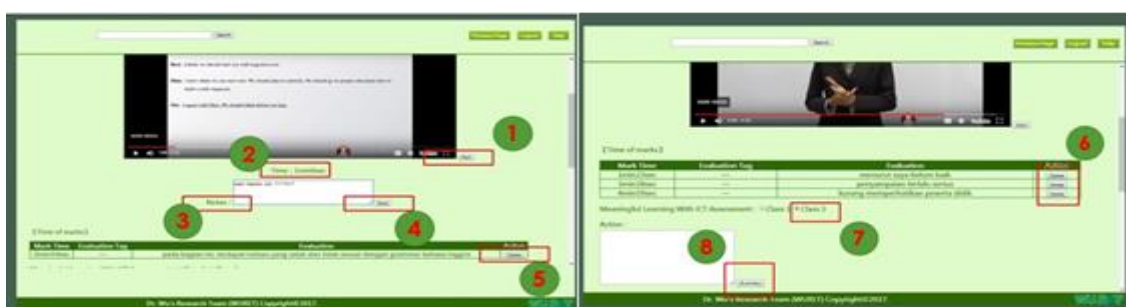
Figure 4. Self-reflection and peer comment feature

Furthermore, for the three main features for novice teachers, there are different features when doing. How to do self-reflection and give a peer feedback is the same way, novice teacher need to mark and give a comments when they notice something regarding to the teaching practice video. These two features have several buttons (i.e., mark, save, delete and summary), slightly different with meta reflection (e.g., reflect).